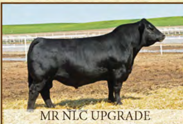
MR NLC UPGRADE