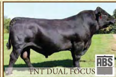
TNT DUAL FOCUS