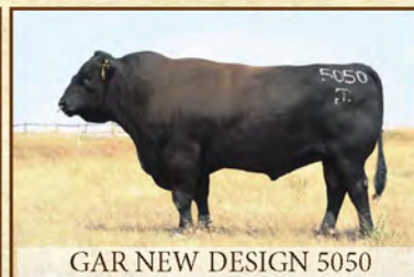
GAR NEW DESIGN 5050